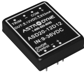
Unit measures 1.6"W x 2"L x 0.45"H