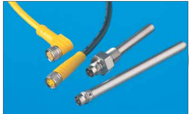
Industrial Grade Temperature Sensors

MS types TS and TX are ruggedized probes that seal the sensing element from the outside environment. Because they include industry standard cordsets and connectors they are extremely easy to use. The sealed end design adds an extra level of moisture resistance over previous designs. These products simplify the installation and connection of temperature sensors in the harshest applications where the protection of the sensing element from the environment is critical. With this new design, it is now possible to have a fully enclosed sensor that will provide a lifetime of accurate and reliable sensing. Please contact the factory for specific design or application information or the availability of options.