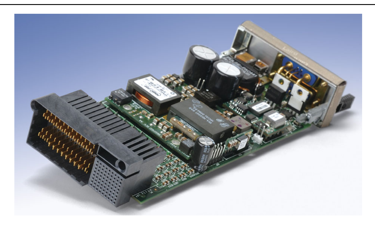
Figure 1 • Actel Power Module