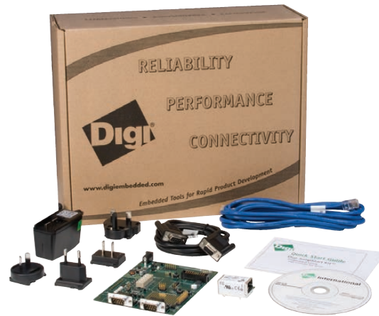
Digi Connect ME kits shown