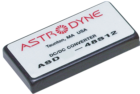
Unit measures 1"W x 2"L x 0.25"H