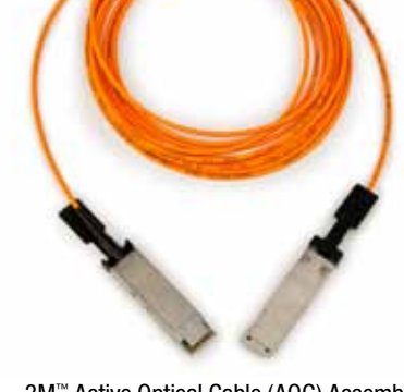
3M<sup>™</sup> Active Optical Cable (AOC) Assembly for QSFP+ Applications