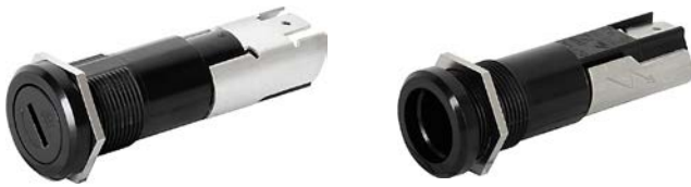
Socket with mounted Cap. Caps see required accessory

FUL, Shock-Safe Fuseholder, 5 x 20 / 6.3 x 32 mm, Slot Knob