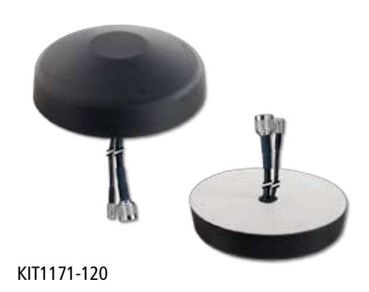
Adhesive mount option available on Low Profile GPS Antennas

More Info: 800.323.3757 www.lairdtech.com