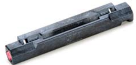
3M™ Fibrlok™ 250 µm Fiber Splice

After the fiber is inserted, the assembly tool depresses the activator cap to align and lock the fibers in place.