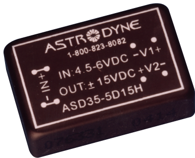
Unit measures 0.8"W x 1.25"L x 0.4"H