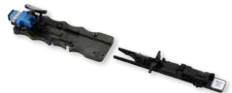
3M™ No Polish SC Connector Assembly Tool 8865-AT