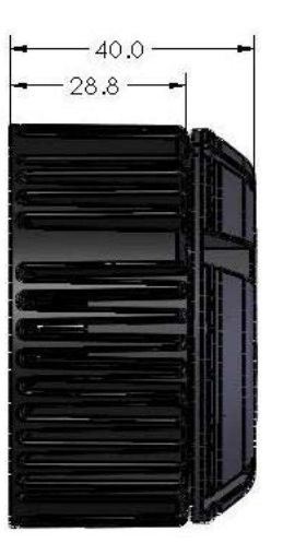
All dimensions are nominal and in mm unless otherwise stated. See product drawings for more detail.