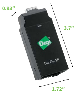
DigiOne® SP - FRONT