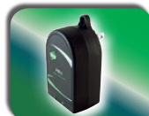
SE Range Extenders