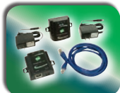
Smart Energy Bundles