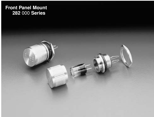
Front Panel Mount 282 000 Series

* Please refer to Fuseology section for information on proper fuseholder de-rating.