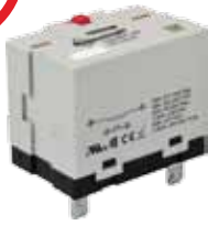
Plug-In Socket Mount Full-feature cover