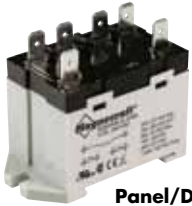
Panel/DIN Mount with quick connect terminals