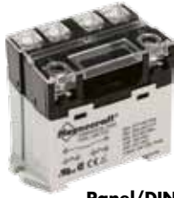
Panel/DIN Mount with screw terminals