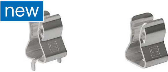
Solder THT version

Heavy Duty Fuse Clip, 10.3 x 38 / 10.3 x 85 mm, 1500 VAC/VDC, 32 A